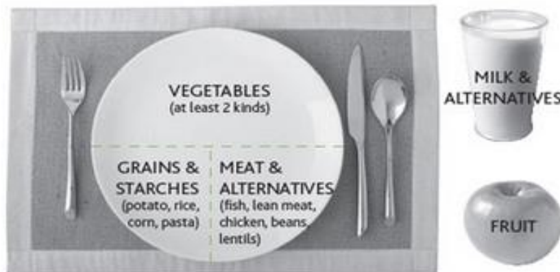
Canadian Diabetes Association (2012). Just the basics.

The Plate Method (see below) is often used by dietitians to teach people how to balance the four food groups at each meal. The Plate Method is an easy way to ensure you eat a healthy amount of each food group at your meals