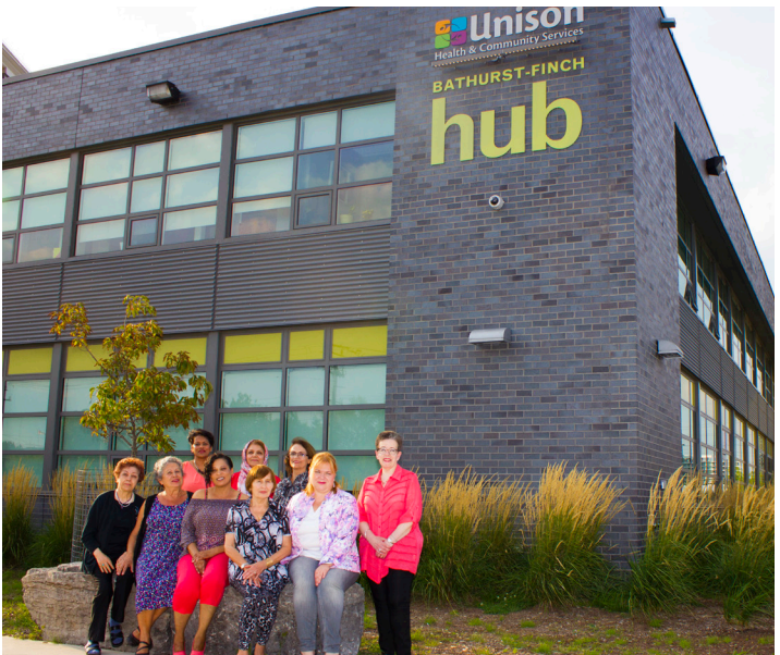
From top: Northview Community Garden, the Bathurst-Finch Hot Pot Cookbook team at the Unison Bathurst-Finch Hub