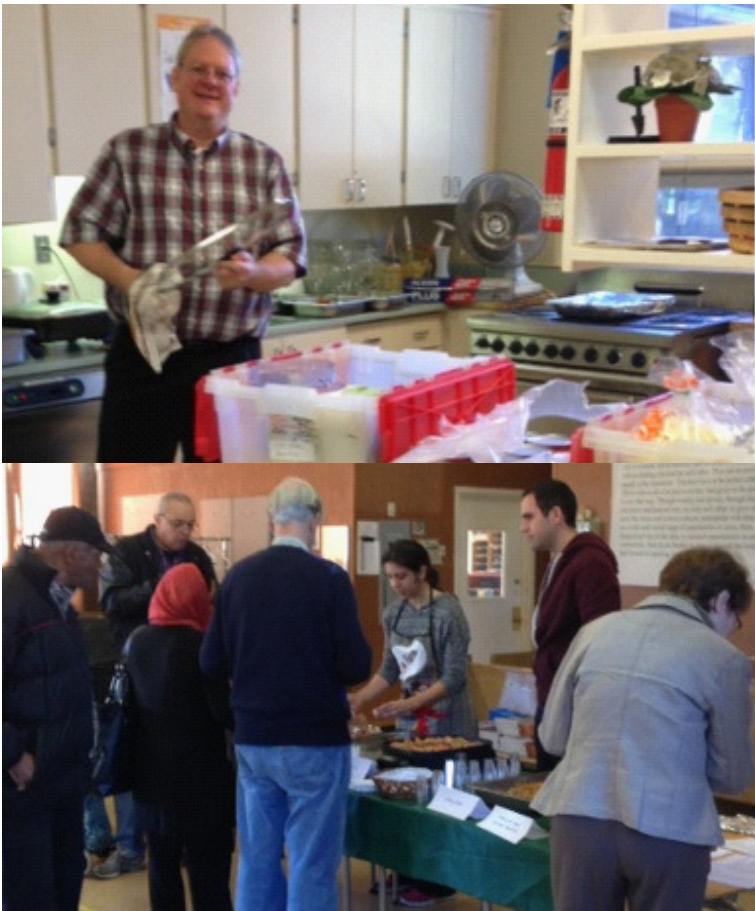
Volunteers and staff at Community Share Food Bank

Toronto Source: City of Toronto, Open Data; Toronto Food Strategy, Toronto Public Health